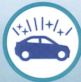
Car Down Payment