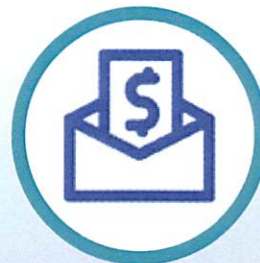
Pay Off Bills