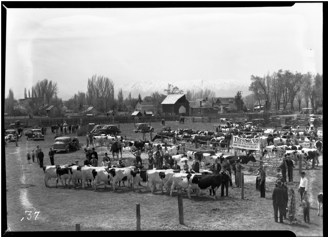
1937 Black & White Days cattle show

Send to terlou38@gmail.com by the 25 th of each month.